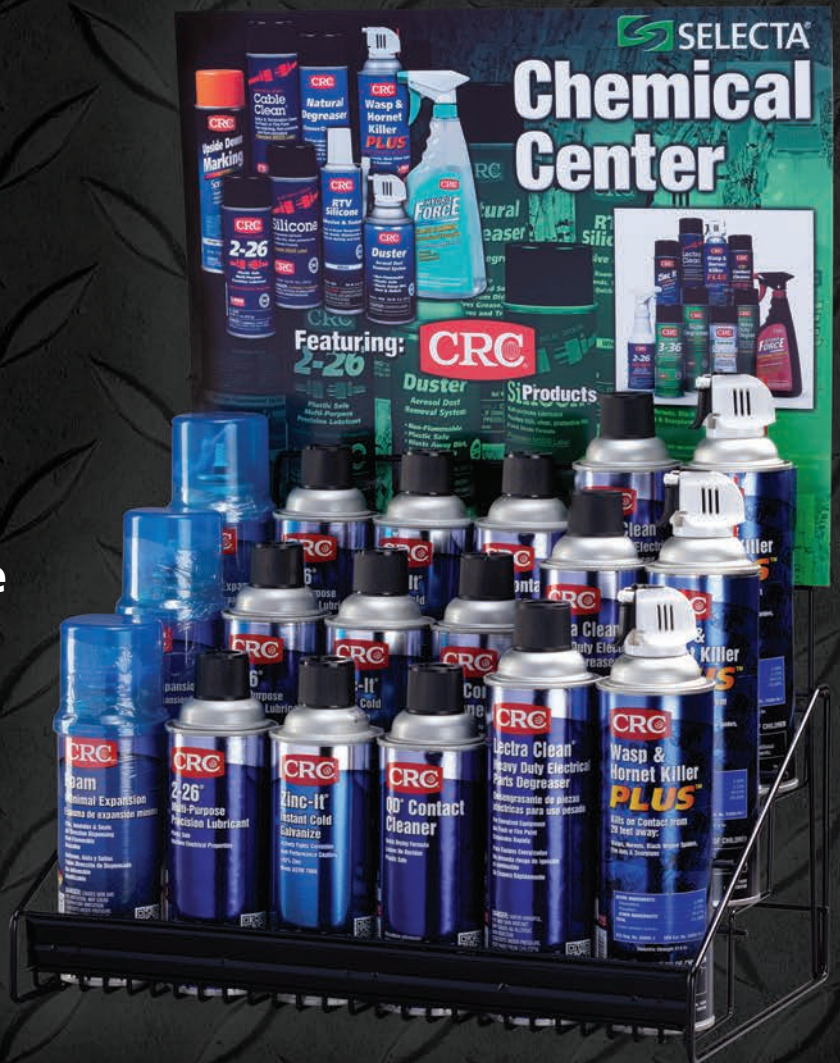
CRC products contained in the kit, shown above.